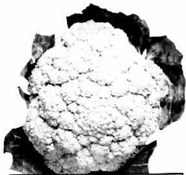
broccoli × cauliflower = broccoflower

In order to alter the genes of a living organism effectively, scientists must understand what genes that organism has and where each gene appears in the genetic sequence. Scientists identify all the genetic information of a species—its genome—by identifying the sequence of bases that make up its DNA. The Human Genome Project involves an international effort to sequence all the DNA found in human chromosomes. The scientists have worked out the initial sequence of approximately 6 billion bases. Now they are working to locate and identify the genes within that sequence. Scientists estimate there are 30,000 genes in human chromosomes.