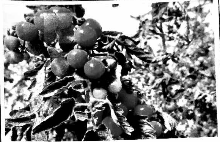
These tomatoes have been genetically altered to grow in conditions that would not support natural varieties of tomatoes.

Agriculture Biotechnology has many implications for agriculture. Disease-resistant crops could improve crop yields. To increase food production, crops could be engineered to grow in environments that would usually not be able to support such crops. The development of pest-resistant crops could reduce the need for chemical pesticides. The use of pest-resistant crops would allow for farming methods that are potentially better for the environment.